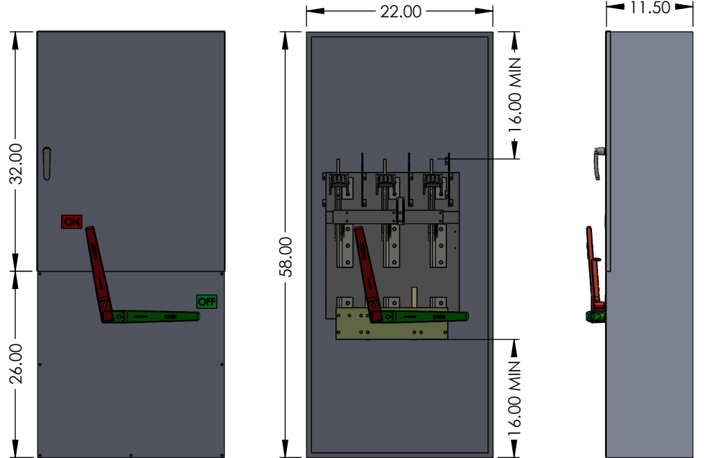
FRONT COVERED VIEW